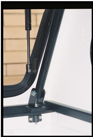
“U” Bracket fitted to ledge of Well Body.

Where there is no solid ledge to mount to, an Angle Bracket must be fitted to top edge of Well Body to provide a strong mounting point to fix the ICB “U” Bracket.