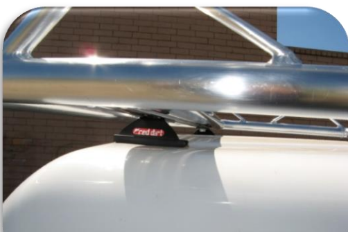
K ICBL40 - REAR LEG MOUNT POSITION