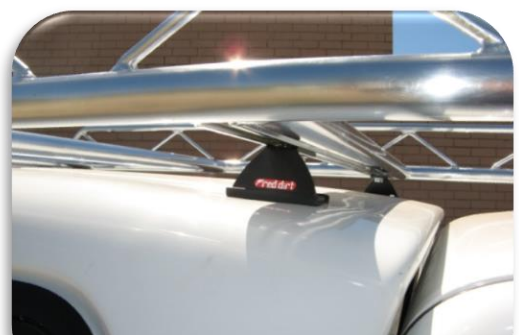
K ICBL60 - FRONT LEG MOUNT POSITION