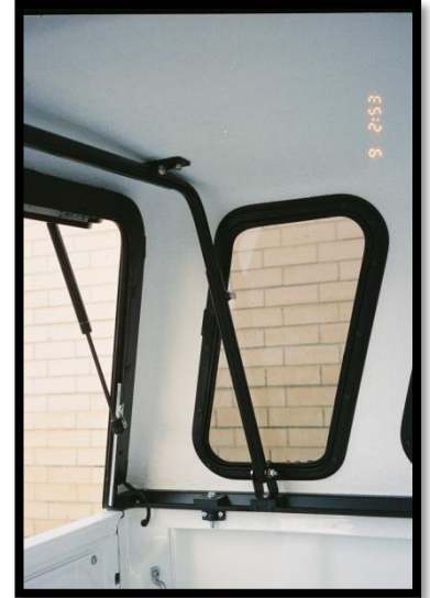
Rear INTERNAL CANOPY BAR fitted to well body Ute.

1.4 With the mounting position established, increase the pressure upwards, until the Crossbar is pushed firmly against the roof, and then tighten all locking bolts firmly.