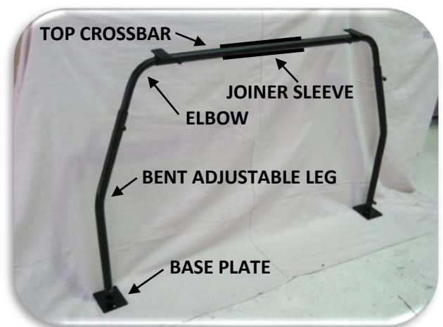
SINGLE INTERNAL CANOPY BAR TO SUIT FLAT TRAY-BACK UTE

1.1 Fit the ICB Elbows into the Crossbar Tube.