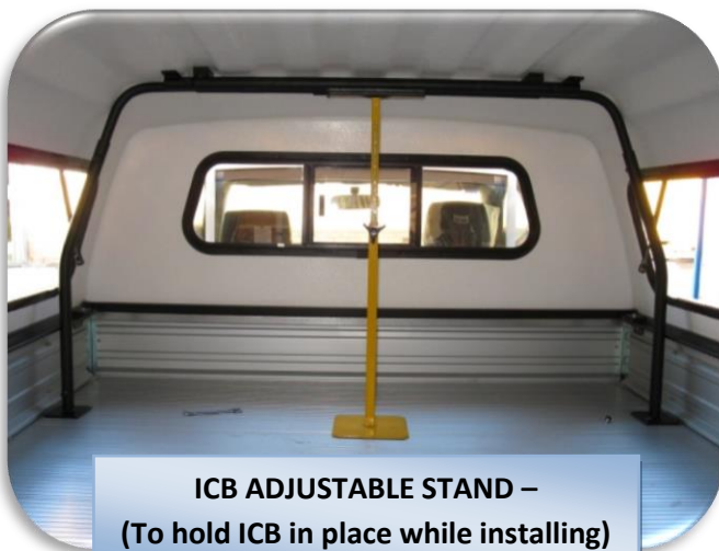
ICB ADJUSTABLE STAND – (To hold ICB in place while installing)