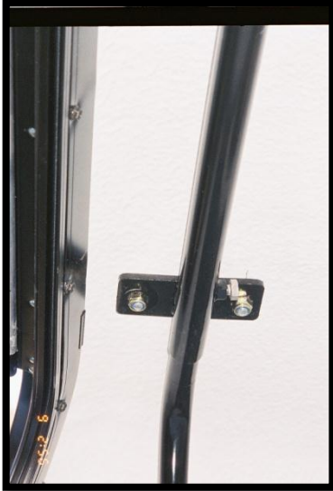
CROSSBAR SLEEVE fixed to inside of CANOPY ROOF.

1.3 Fit the Adjustable Legs to the Elbows, with "U" Brackets attached to the bottom end. Pivot the Adjustable Leg and "U" Bracket to a suitable position, which allows you to fix the "U" Bracket through the top edge of the well body, existing Canopy fixing bolts or Well body floor.