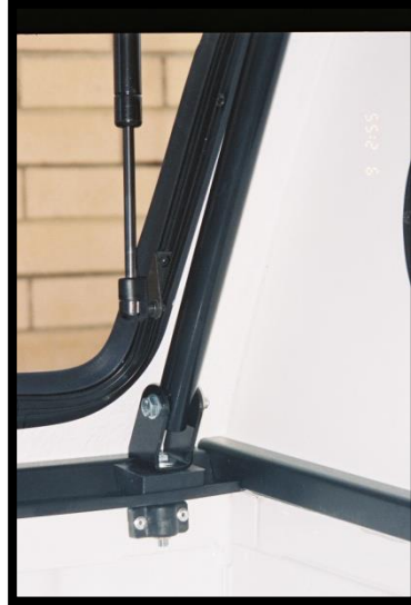
ADJUSTABLE LEG secured in place by "U" BRACKET by using existing fixing