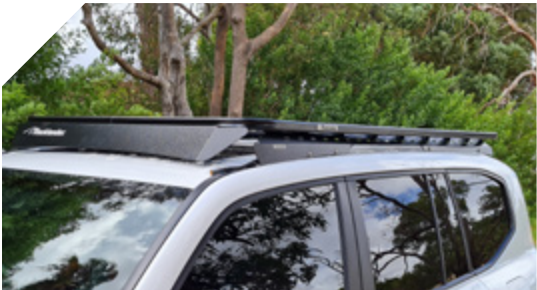
Tracklander 2.2m flat top on new TOYOTA LC300 Series.

Eliminate the wind noise and drag. All tracklander roof racks include a vehicle-specific wind deflector at no extra cost.